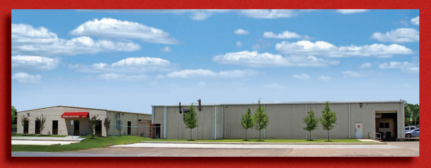
Girard products distributed by:

All the products depicted in this brochure are manufactured by Girard Industries.